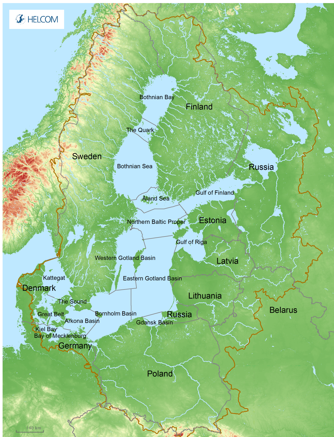
Figure A.1: Map of the Baltic Sea showing the 17 sub-basins (Map taken from http://stateofthebalticsea.helcom.fi/in-brief/our-baltic-sea/ )